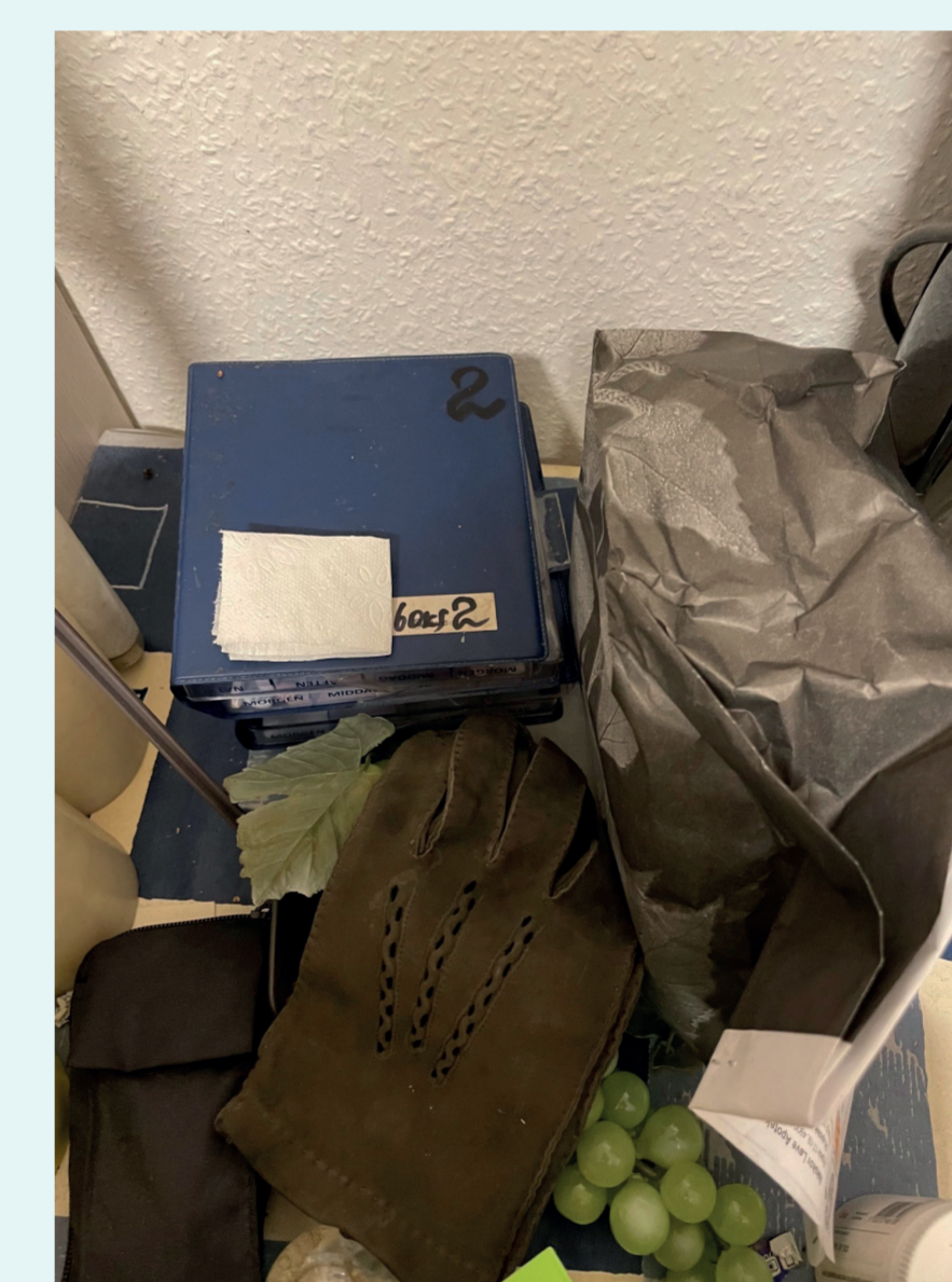
Photo 3 It can be difficult for a home care nurse to follow procedures in the management and administration of medicines because of mess in the patient's home.

The following themes were identified from interviews with 27 municipal managers and visual storytelling with 17 municipal employees: