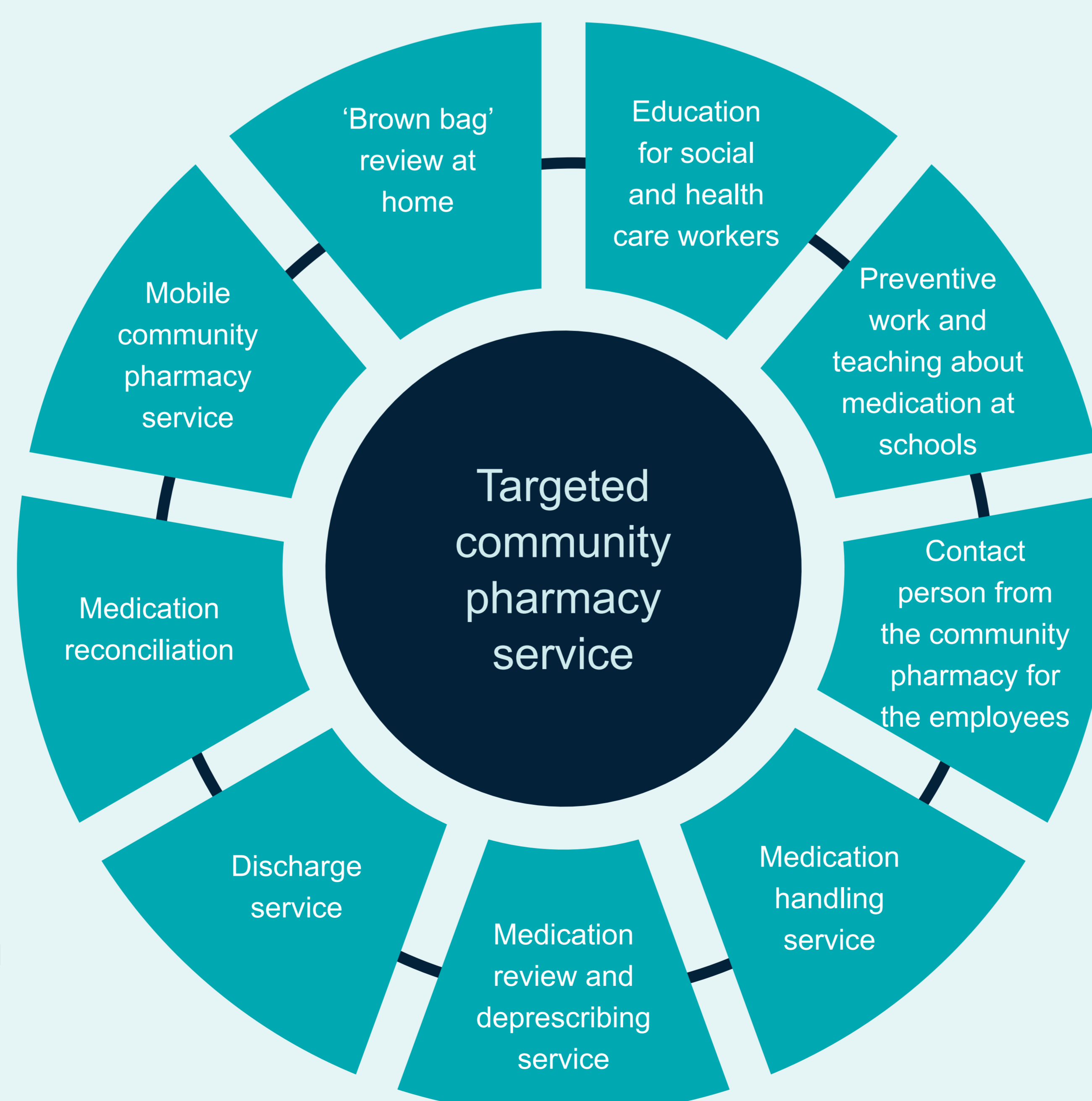
Figure 1: The ideas of how community pharmacy technicians can contribute to medicine safety in the municipalities at a workshop with stakeholders.

At the workshop with stakeholders, results were presented and stakeholders generated ideas on how pharmacy technicians from CP can contribute to strengthening medication safety in municipalities (figure 1)