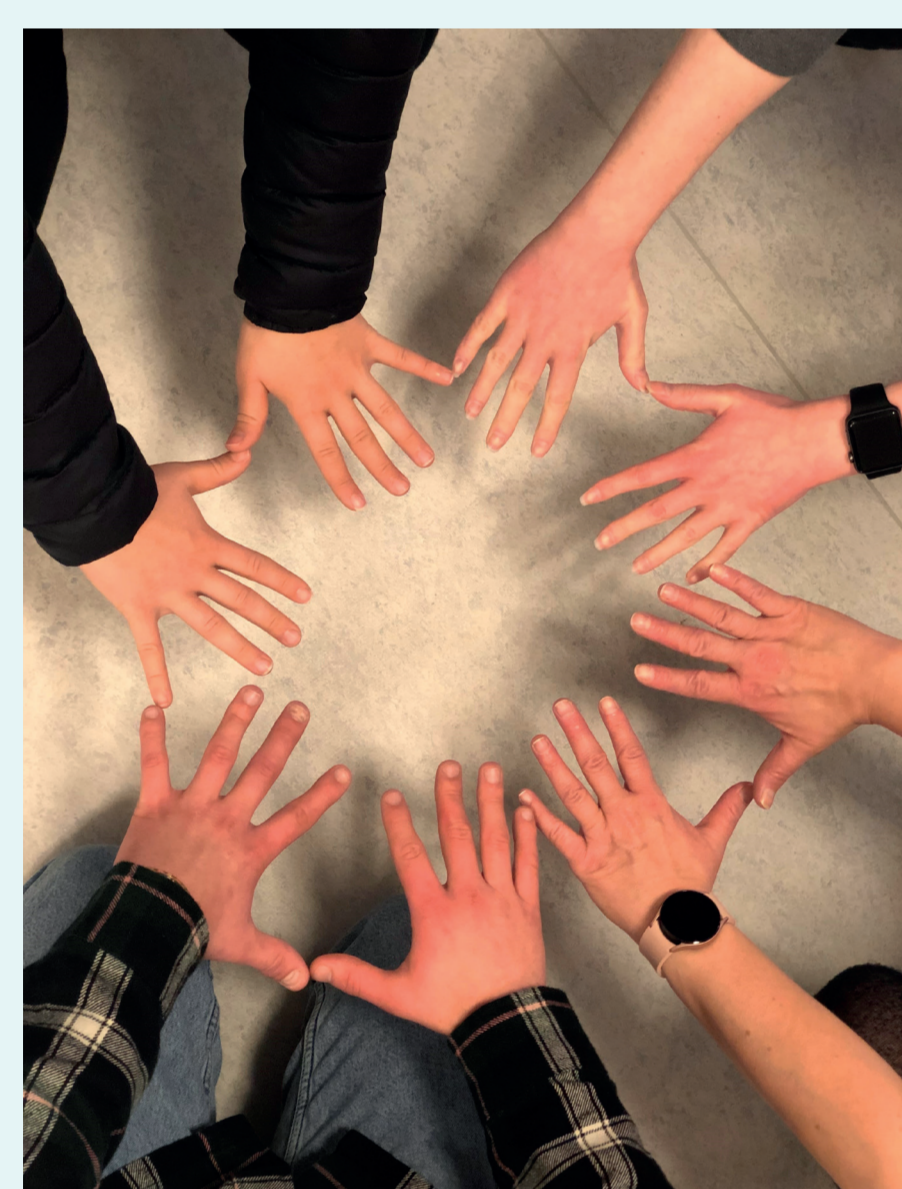
Photo 1 Many employees with different competencies and skills help the patient and need to work together and use the right skill for the right task.

Examples from the visual storytelling interviews with municipal employees about challenges concerning medication: